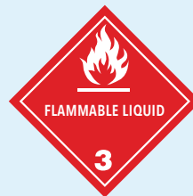
Ignitable Liquid Department of Transportation (DOT) warning label or placard