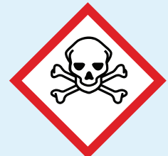
Toxic Substance Occupational Safety and Health Administration pictogram